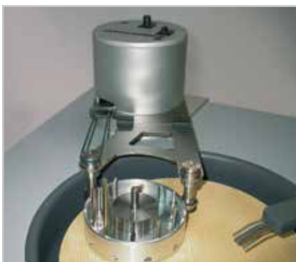
Example with sample holder (accessories)